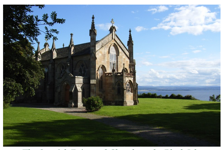
The Scottish Episcopal Church on the Black Isle Eaglais Easbaigeach na h-Alba san Eilean Dubh