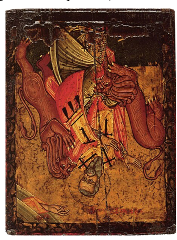
Icon of St. Ignatius from Pushkin Museum, Moscow.

St Ignatius of Antioch (17<sup>th</sup> Oct) also known as Ignatius Theophorus (Greek "God bearer")