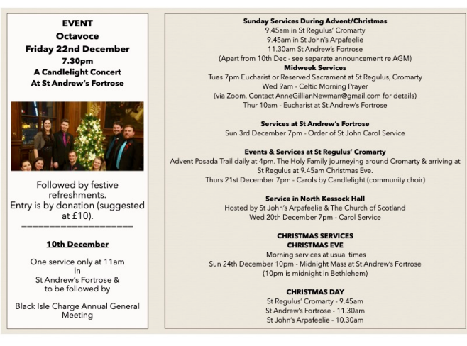
Note the Posada events in Cromarty will not now be taking place. OCTAVOCE

Friday 22nd December at 7.30pm, St Andrew's Church, Fortrose UNRESERVED SEATING - FIRST COME FIRST SERVED.