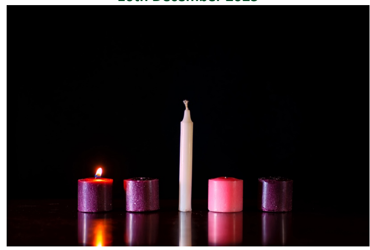
The Scottish Episcopal Church on the Black Isle Eaglais Easbaigeach na h-Alba san Eilean Dubh