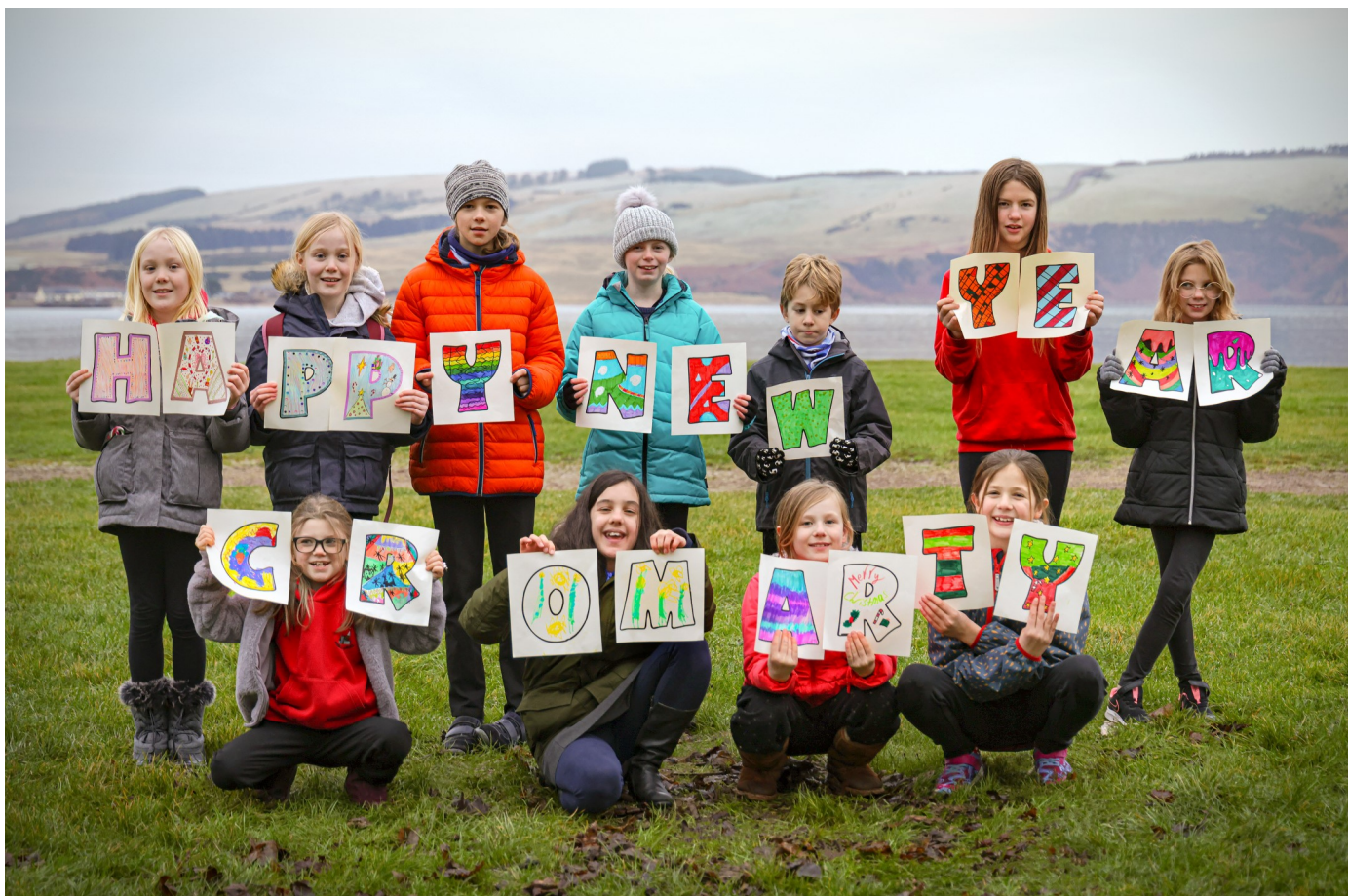
Some members of the Sunday Club bringing brightness through the dark days

Despite ongoing restrictions, the Cromarty Sunday Club have managed to meet up on a monthly basis for most of the year. An overall theme in 2021 has been Climate Change and looking after god's creation. We have gone from being a club that met indoors to one that now meets outdoors and we hope to continue that in 2022. It is a popular move with the children and adds a new dimension to storytelling and craftmaking when it is outside.