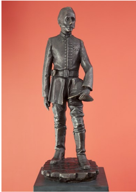
James Braidwood, Father of the Modern Fire Service 03 rd September 1800 – 22 nd June 1861

Due to the ongoing circumstances surrounding Covid-19 we will, again, be unable to gather at St. Andrew's church, together with members of the Scottish Fire and Rescue Service, to celebrate the life and legacy of James Braidwood on Sunday 20 th June, as we had hoped we would be able to do. Please remember him in your prayers on the 160 th anniversary of his untimely death, as well as our brave fire fighters today who are already battling wild fires in The Highlands.