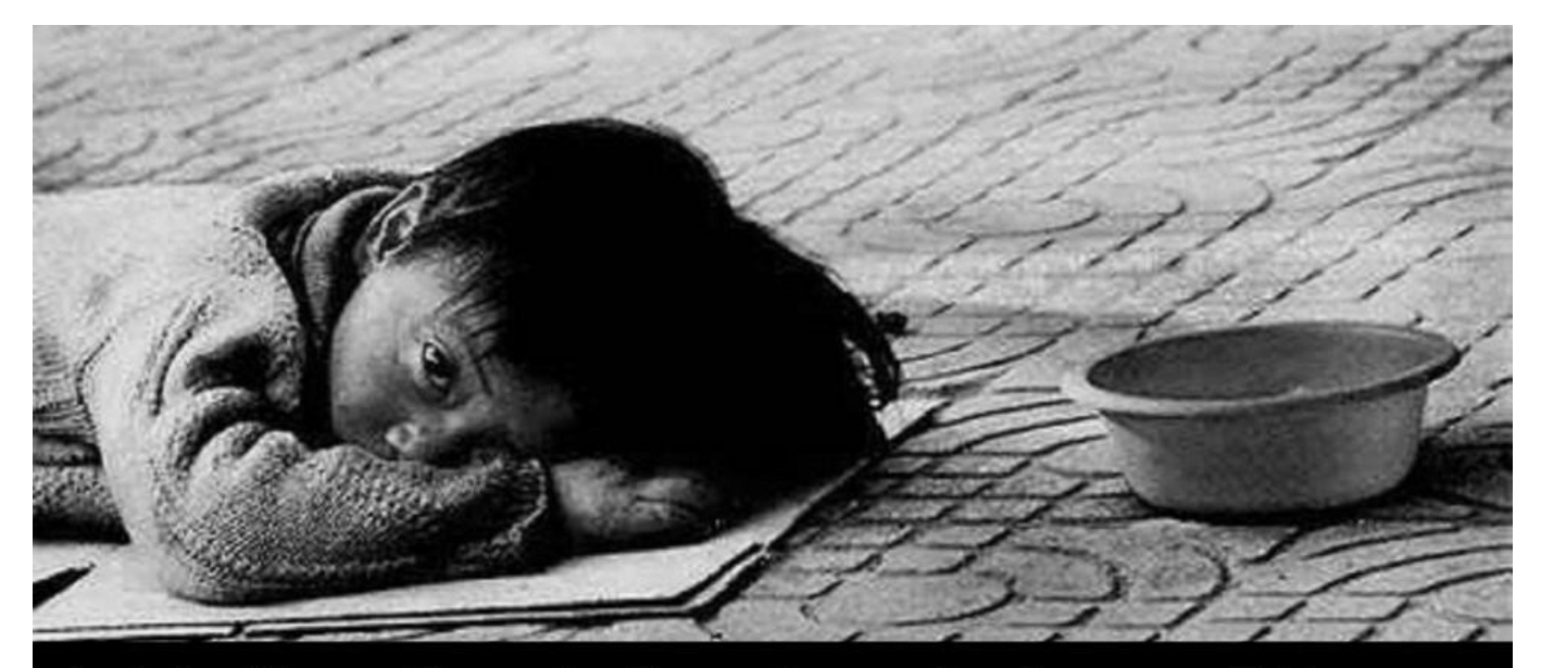
And the King will say: I tell you the truth, when you did it to one of the least of these my brothers and sisters, you were doing it to me! Matthew 25:40