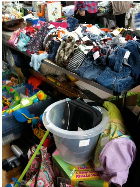
TABLE TOP SALE