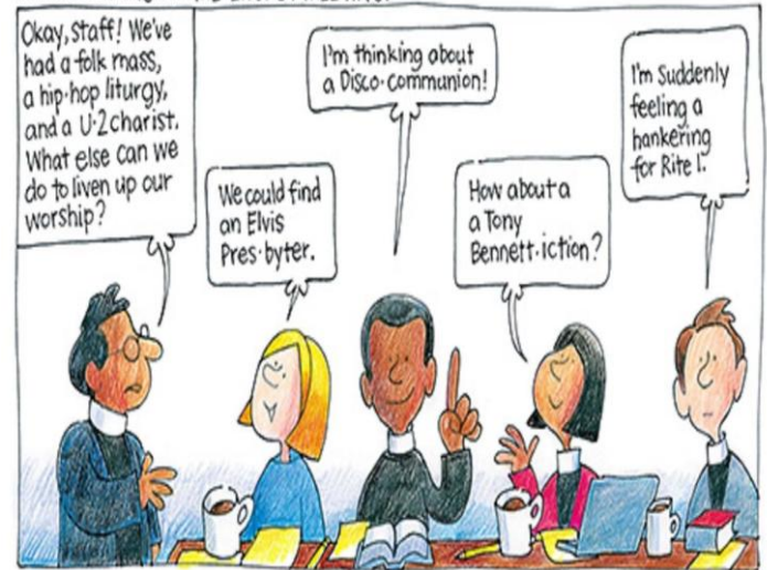
BRAINSTORMING AT THE LITURGY MEETING.

“This is the rule of most perfect Christianity, its most exact definition, its highest point, namely, the seeking of the common good ... for nothing can so make a person an imitator of Christ as caring for neighbours.”