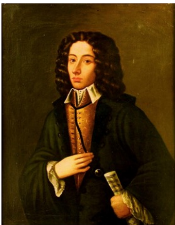
Giovanni Battista Pergolesi 1710 -1736

St Andrew’s Church, Fortrose Sunday 7th April 2019 at 3pm