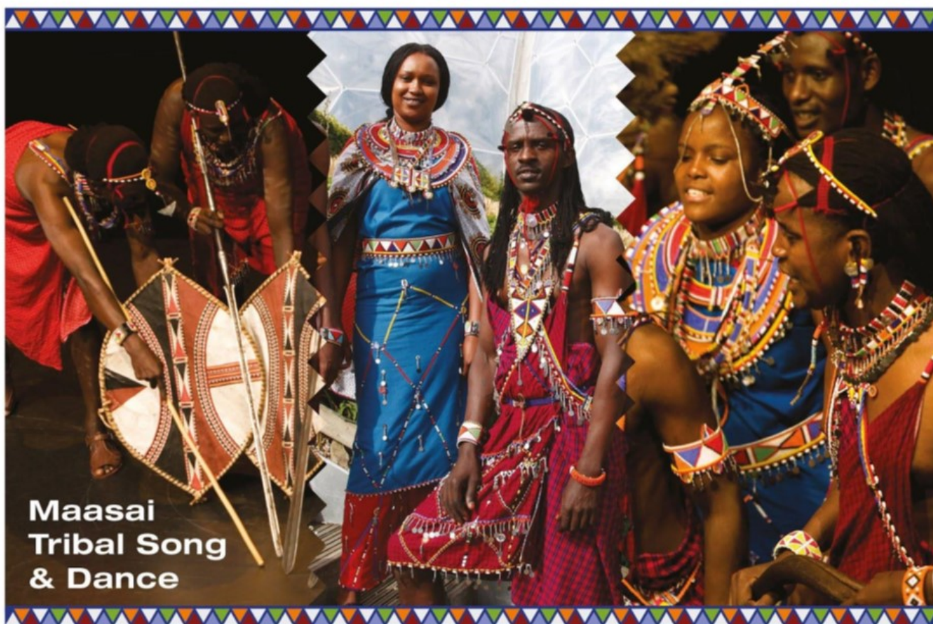
Maasai Tribal Song & Dance